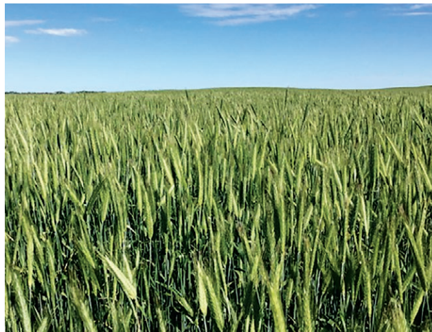
Figure 1. Field of hybrid fall rye Bono growing in Western Canada.

ing increasing rye level replacing wheat grain reduced hog feed intake and weight gain, but feed efficiency was not affected (Figure 3). Enzyme inclusion did not affect feed intake and feed efficiency, but tended to increase overall weight gain by 20 g/d. Enzyme inclusion improved feed efficiency only for hogs fed the high rye level whereas it did not affect feed efficiency for hogs fed low or medium rye levels. Days on