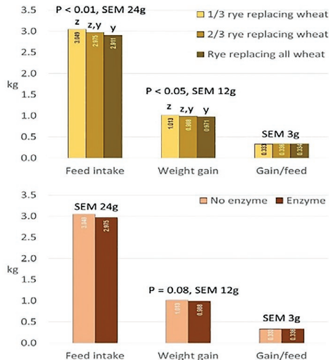
Figure 3. Daily growth performance (0 – 76d) of hogs fed increasing hybrid rye level replacing wheat grain with or without enzyme.

most water giving feed enzymes more time to breakdown the rye complex sugars. Carcass dressing was not reduced because the rye complex sugars were mostly soluble instead of bulky, insoluble cereal hulls (bran) so that did not increase gut weight or thickness. Backfat did not increase or decrease because we accounted for the greater rye complex sugars content as a lower net energy value for rye compared with wheat grain. Loin depth was also not affected because we correctly accounted for differences in amino acid (the chain links of protein) digestibility between rye and wheat